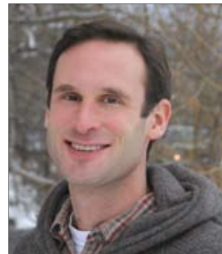
by Joshua Burnim, Safe Passages Program Coordinator

T hrough our Safe Passages program, American Wildlands is striving to make the U.S. Northern Rockies a showcase for safe passage projects that demonstrate how highways can be designed or re-constructed to allow for the migratory needs of wildlife, while providing increased safety for the people who drive these highways. The program's primary objective is to help establish a regional culture that supports the concept and implementation of highway safe passages for wildlife. We believe that if the region's elected officials, agency decision-makers and general public support the concept of safe passages, then the practitioners of this increasingly important aspect of wildlife management will have an easier time developing safe passage structures and other mitigation measures.