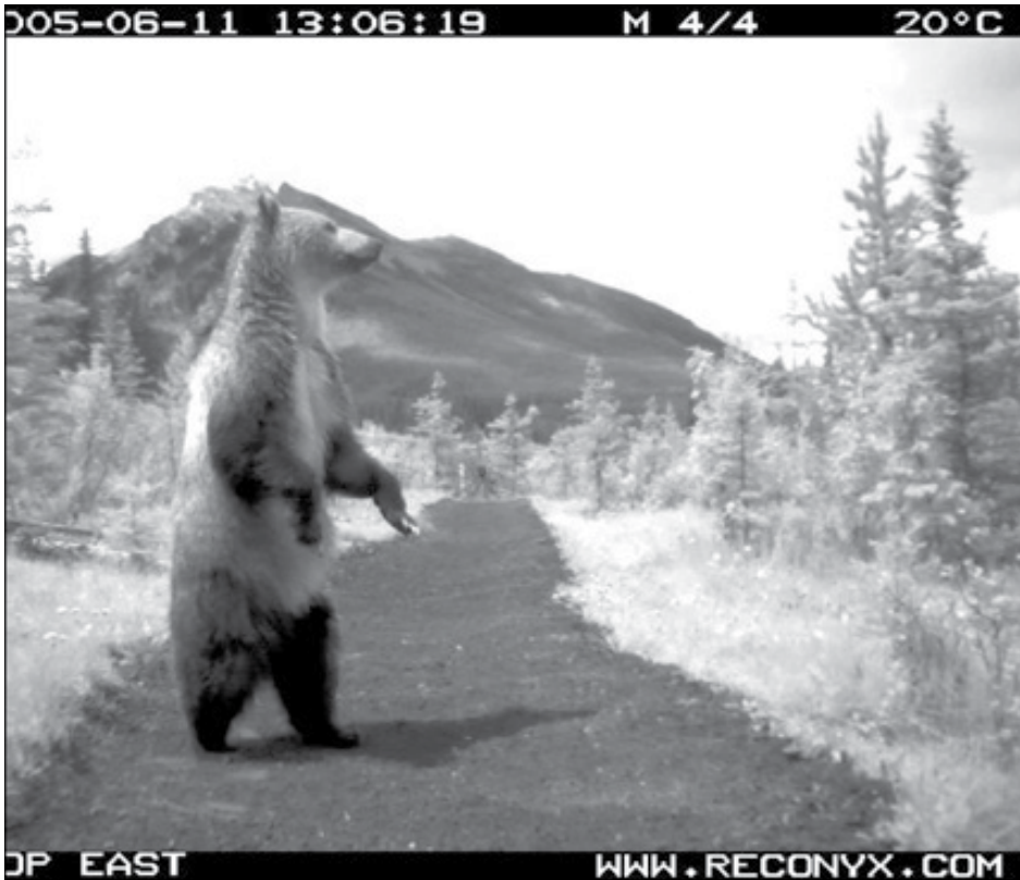
Grizzly bear on wildlife overpass in Banff National Park.