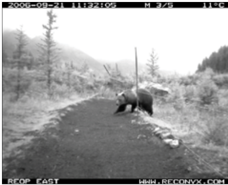
A grizzly bear climbs through a barbed wire hair sampling system on a wildlife overpass in Banff National Park.

1041 black bear passages across the 24 wildlife crossings along the Trans-Canada Highway (TCH). However, the number of unique individuals and their sexes remain unknown. A recent pilot study addressed this issue by using a barbed wire hair sampling system to obtain bear DNA samples at two of the crossings. Genetic analysis revealed that 5 grizzly bears (3 females, 2 males) and 4 black bears (2 females, 2 males) used the two underpasses in 2005. Encouraged, in 2006 researchers installed hair sampling systems at 22 of the crossing structures, and also used hair snares and rub tree surveys to sample the population surrounding the TCH. The genetic results from the first field season are pending. Video of