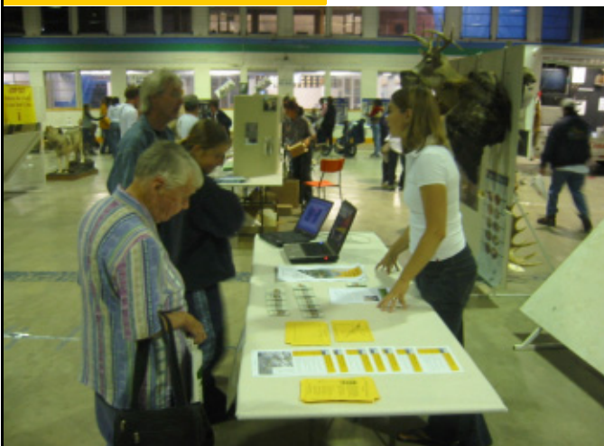
Road Watch booth at "Going Wild" during Rum Runner days.