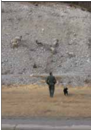
John Clarke and Kuma chasing bighorn sheep off Highway 3.

The map depicts the number of bighorn sheep observations per 250 m along Highway 3. A higher bar means more observations have occurred within that segment. The graph depicts the number of bighorn sheep observations per month over the last two and half years. Sightings of bighorn sheep are most common in the winter and spring from Nov to May.